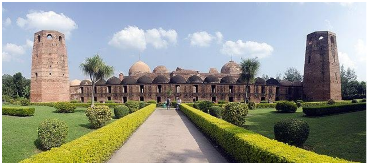
Katra Mosque, Murshidabad

Ride the Toto (electric-rickshaw) to the Katra mosque . Built by the first Nawab of Murshidabad – Murshid Quli Khan in the 1724-25, this mosque has distinctive minarets from which the muezzin calls the faithful to Friday prayers.