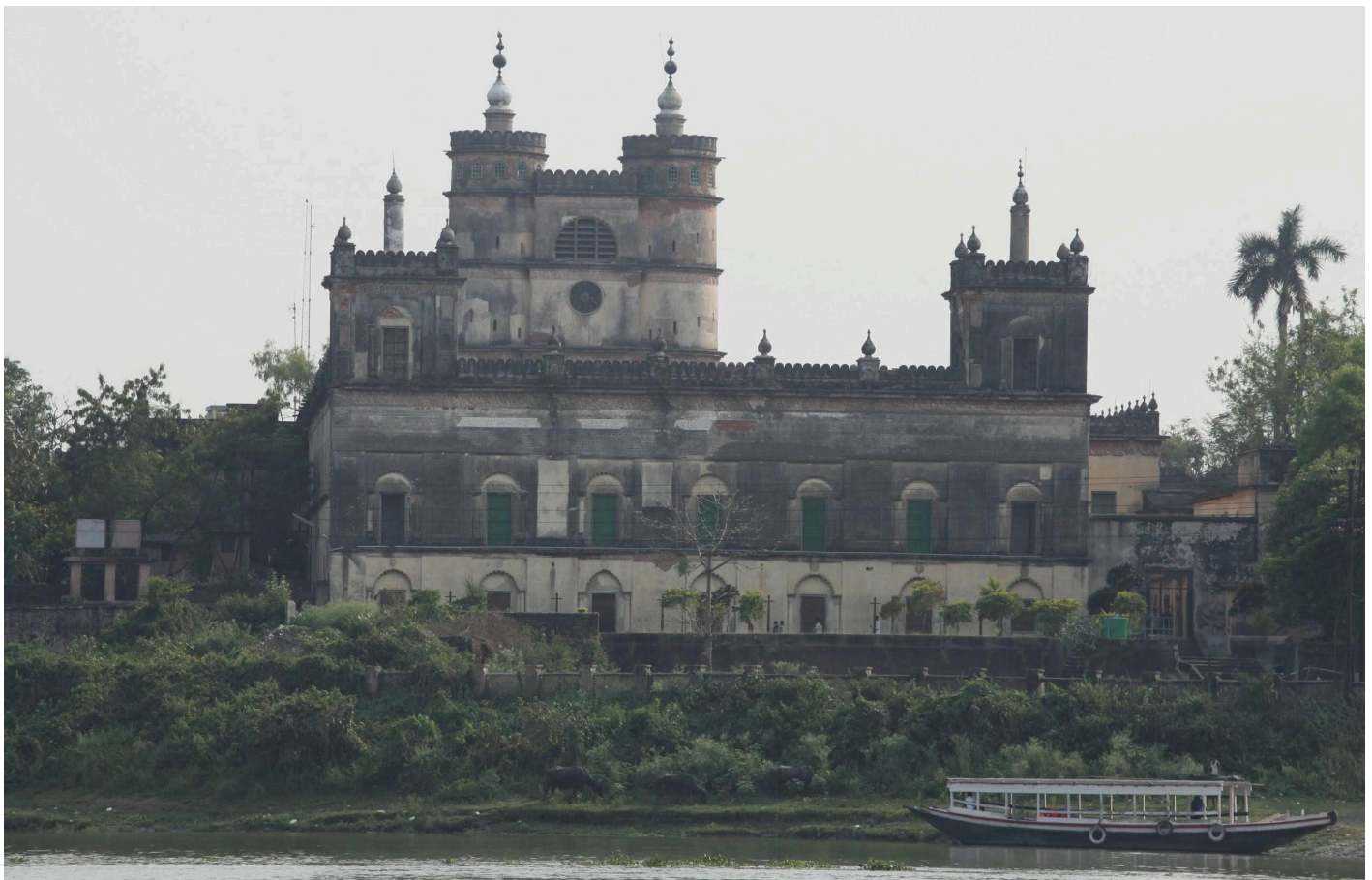
Hooghly Imambara, Bandel

We set sail upstream to Bandel, meaning port in Bengali. It was founded by Portuguese settlers who built the Church and a Monastery around 1660. Afternoon, visit the Hooghly Imambara , one of the famous Shiya pilgrimage centres in West Bengal, built in 1841 by Haji Mohammad Mahasin. The two-story building and surrounding rooms provide housing for pilgrims as well as classrooms, or Madrasa that teach the Koran. The structure contains a Victorian-era clock with a winding key weighing 20kg. Large Persian chandeliers and lamps light the Imambara's stunning hallways and passages.