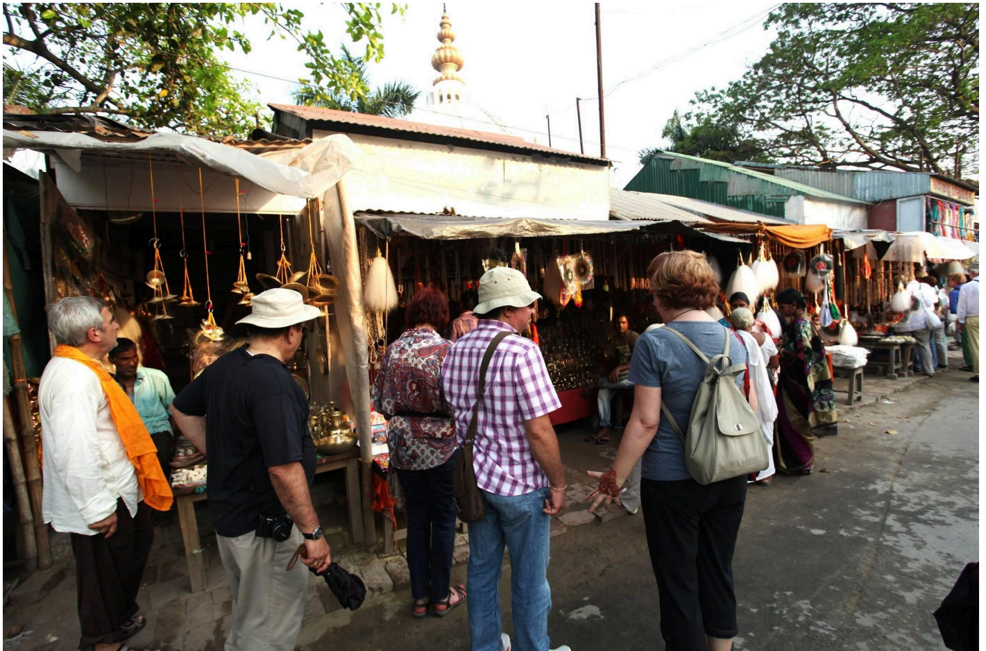
Pilgrim's Bazaar, Mayapur