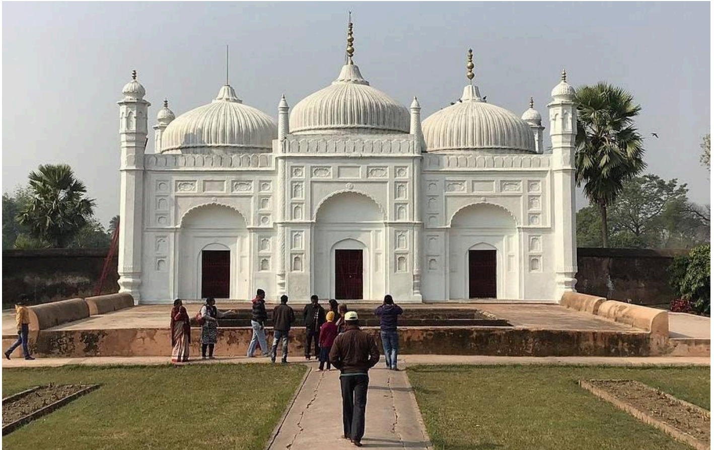
The Mosque at Khush Bagh

Highlights of the Day: Marvel at the deft hands of the brass-smiths at work creating wonders on metal. Walk through farmland to the peaceful garden tomb.