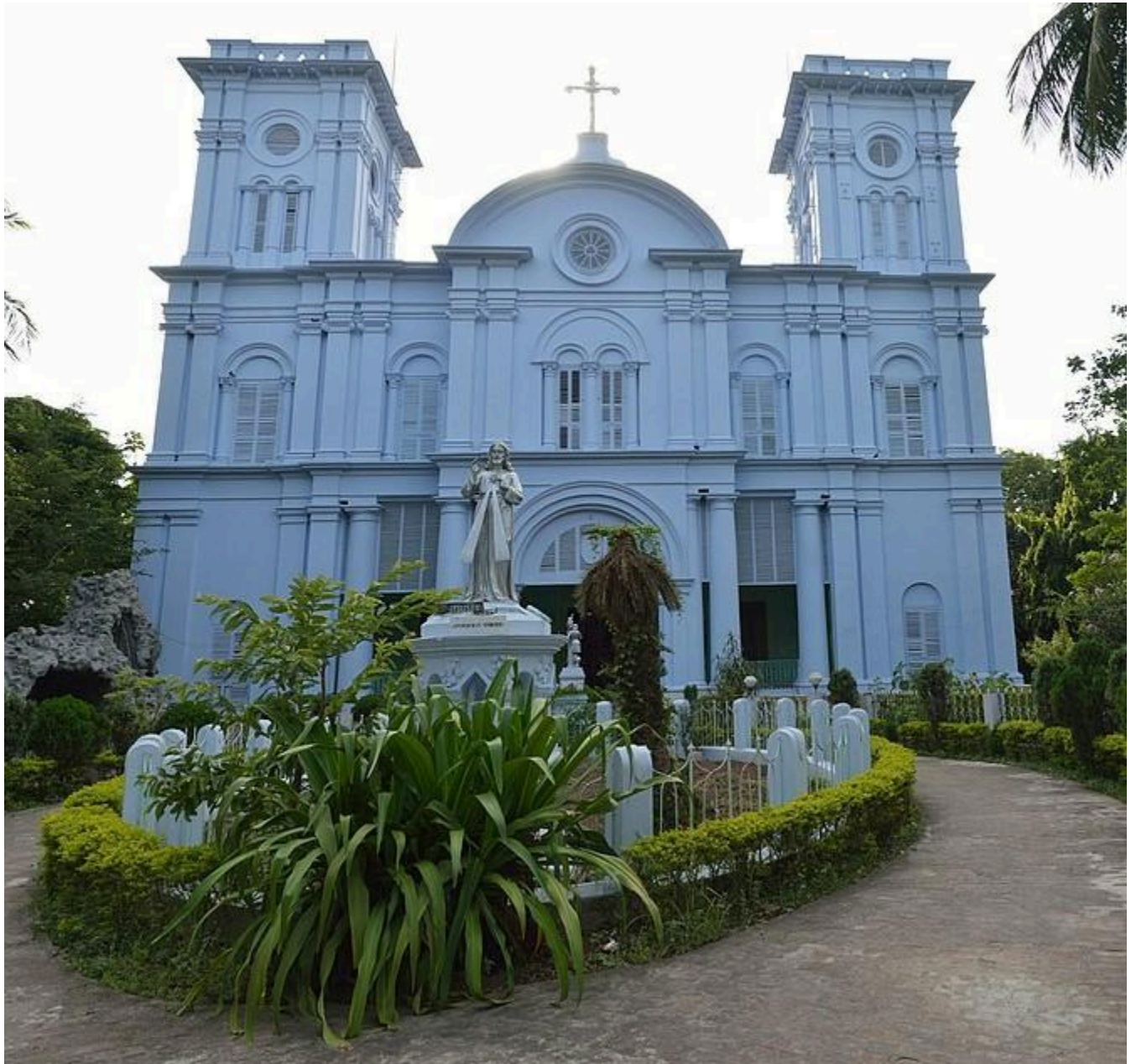
Sacred Heart Church, Chandernagore

Also visit the Sacred Heart Church, designed by French Architect Jacques Duchatz. The church was inaugurated in 1884 and stands for over two centuries to mark the beauty of the architecture during the French period.