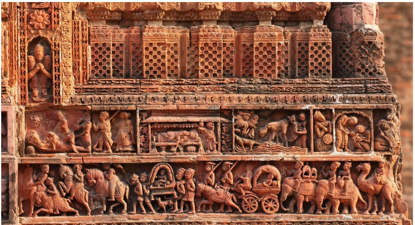
Terracotta plaque, Kalna

In the morning enjoy a rickshaw ride through the town centre of Kalna to visit the enchanting Rajbari Temple Complex , which has the highest concentration of temples in the region. Visit the Nabakailas Temple, built in 1809 by the Bardhaman Maharaja, which contains 108 eight slope-roofed shrines dedicated to Lord Shiva. Other temples in the complex feature diverse architecture and terra cotta plaques depict themes of Hindu epics, mythical life of Sree Chaitanya, images of Durga, and various aspects of day-to-day life in the region.