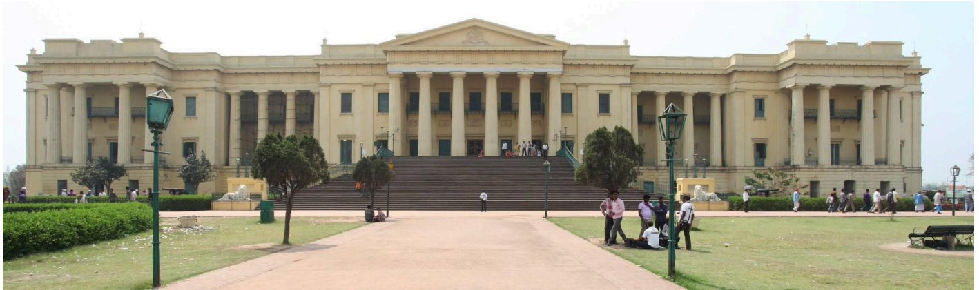
Hazraduari Palace, Murshidabad

antiques, artwork and manuscripts. Opposite to the Palace is a vast Imambara – built by the Nawab for worship.